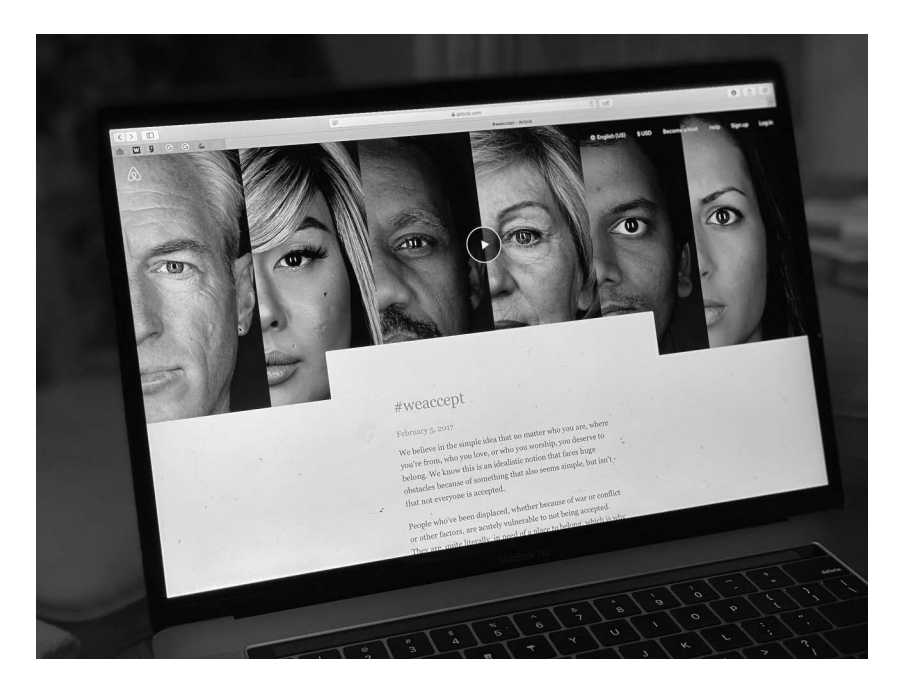
Figure 1.1 Airbnb's #WeAccept campaign.

norms of reciprocity, rather than an explicit agreement, obligate them to give to others in return (Mauss [1925] 1966). Individuals who give an item to a friend or family member to celebrate events such as a quinceañera —a Latinx coming-of-age tradition to celebrate a girl's 15th birthday—or who give a donation to a nonprofit such as an Asian American or Native American cultural institution are engaging in gift giving. Barter , or the trade of goods and services, is another type of exchange. For example, if neighbors trade homemade food with one another, such as kimchi and fry bread, they are bartering. Although gift giving and bartering exist in contemporary societies, much of the consumption in places like the United States involves consumers paying sellers money for goods and services.