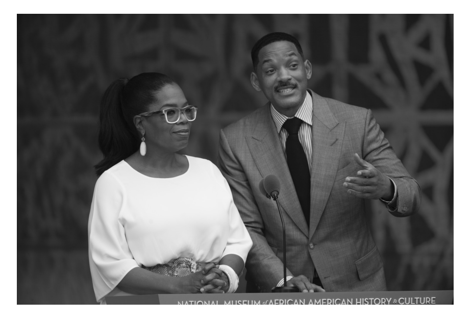
Figure 1.1 Oprah Winfrey (left), who donated over $20 million to the National Museum of African American History and Culture, at the museum's opening ceremony, with the actor Will Smith (right).

view black museum philanthropy as a means to not only "do good" but also "do well" through promoting their careers, while supporters who work in other sectors are less likely to view giving as having direct professional benefits. Cultural connoisseurs typically see art and history as the lifeblood of black museums, yet cultural appreciators are often less interested in black museums as purely cultural institutions. And, although supporters across the generations share a concern with positioning African American museums as 21st-century institutions, it is often Generation Xers and Millennials who are the most committed to a focus on contemporary culture, politics, and technology.