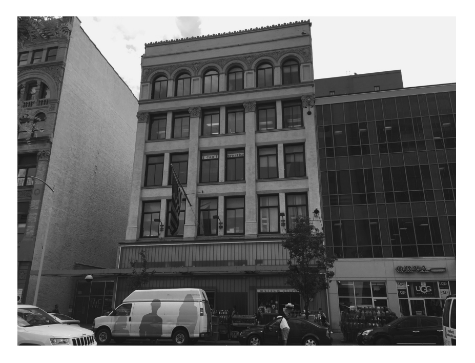
Figure 1.6 The Studio Museum in Harlem, New York.

into bankruptcy and closed. It reopened in 2014 after foundations in the city formed a consortium to raise funds and purchase the center (O'Toole 2015). Even old guard museums like the Charles H. Wright Museum of African American History have faced financial difficulties. In 2004, the Detroit institution needed emergency funding from the city to remain open (Montagne 2004).