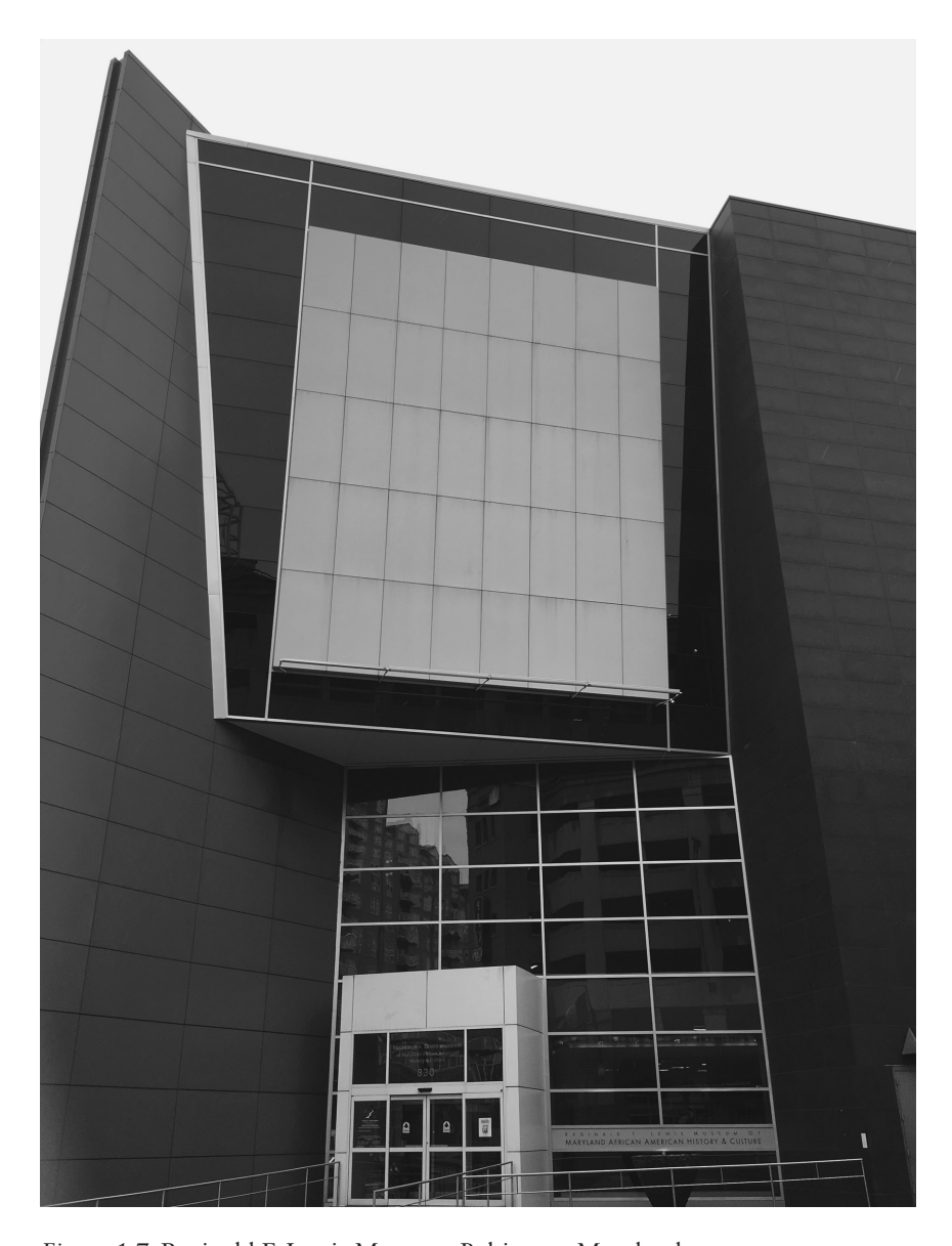
Figure 1.7 Reginald F. Lewis Museum, Baltimore, Maryland.

institutions. Understanding the meanings and motivations underlying their philanthropy can help us gain both insight into the development of this field of museums and broader perspective on social boundaries and cultural patronage. This line of inquiry can also offer practical insights that are important for the sustainability of black museums. 12