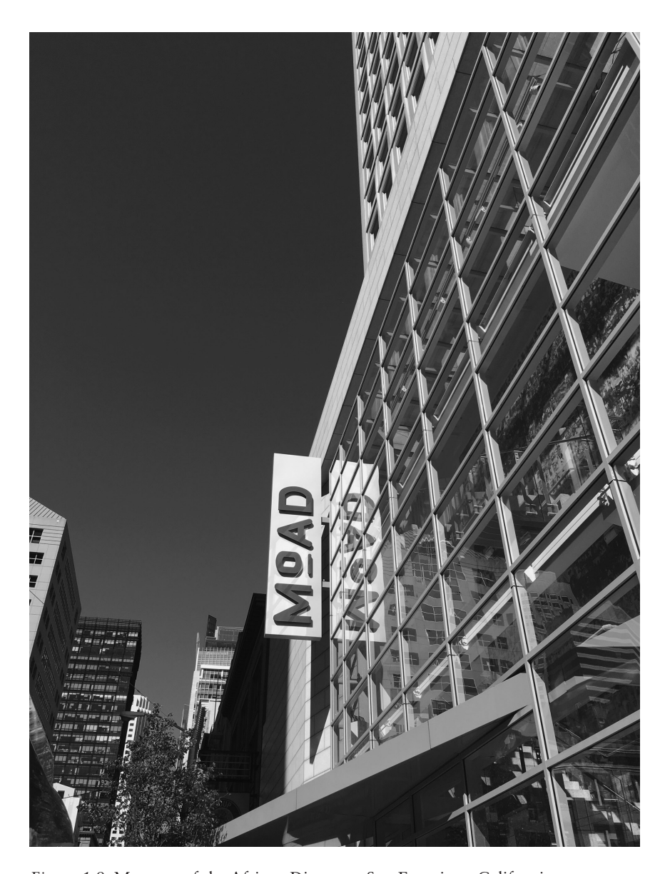
Figure 1.9 Museum of the African Diaspora, San Francisco, California.

the remaining mainly members of committees or friends groups. I identified the majority of participants from publicly available lists of supporters such as annual reports. The semistructured interviews typically took place in participants' offices, though in some cases I also met them in other places, such as museums, homes, and restaurants. Most often the interviews began