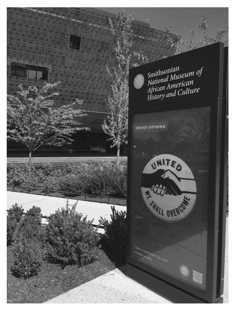
Figure 1.4 National Museum of African American History and Culture, Washington, DC.

build new black museums in states such as Florida, Georgia, and California (Harris 2018; McMorris 2018; Prabhu 2018).