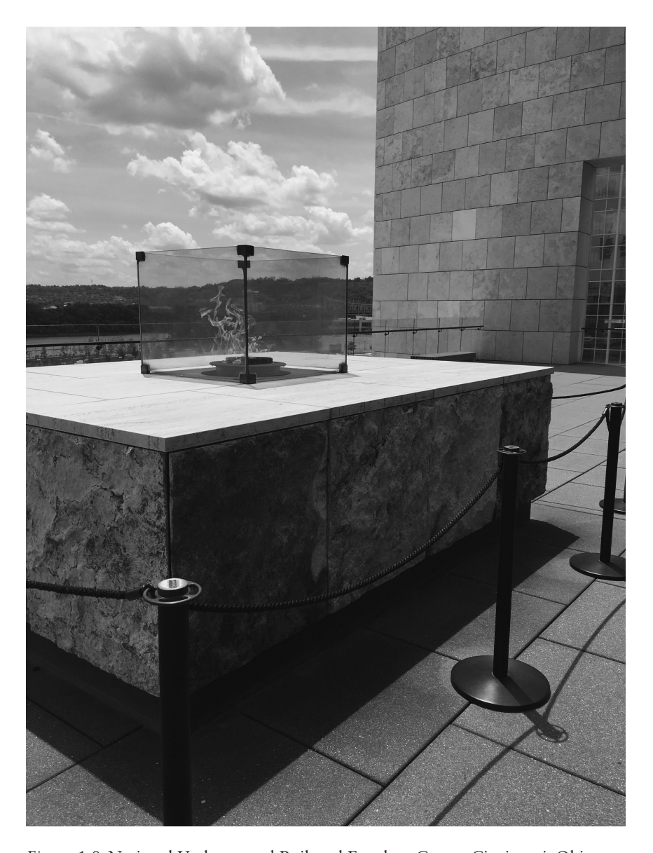
Figure 1.8 National Underground Railroad Freedom Center, Cincinnati, Ohio.