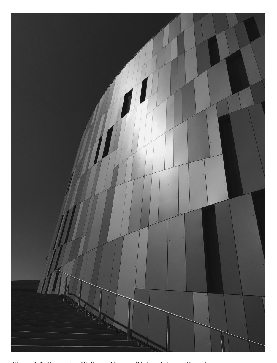
Figure 1.5 Center for Civil and Human Rights, Atlanta, Georgia.

Slavery Museum still have not gotten off the ground despite years of efforts (Manly 2016). Others had noteworthy capital campaigns yet quickly ran into financial challenges after opening. For example, soon after the National Underground Railroad Freedom Center opened, it faced a $5.5 million deficit (Post Staff Report 2007). Similarly, four years after the August Wilson Center in Pittsburgh, Pennsylvania, opened to wide acclaim in 2009, it went