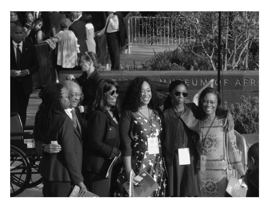
Figure 1.2 The television producer Shonda Rhymes (center), who donated $10 million to the National Museum of African American History and Culture, at the museum's opening ceremony.

among the upper-middle and upper class. By elaborating how subgroups within the upper-middle- and upper-class value black museums in distinct ways, Diversity and Philanthropy at African American Museums sheds light on the intraclass divisions that mark museum patronage. It also offers new theoretical insights on the interconnections between social boundaries and cultural participation more broadly. Before delving into the world of philanthropy at black museums, it will be helpful to understand their trajectory of growth. In the next section, I provide an overview of the development of the field of black museums.